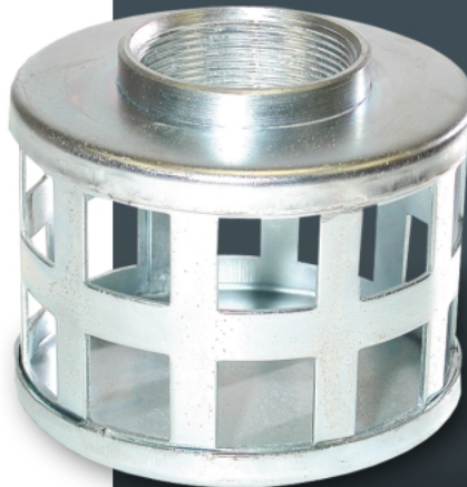
Trash Type Suction Strainer w/ Large Openings