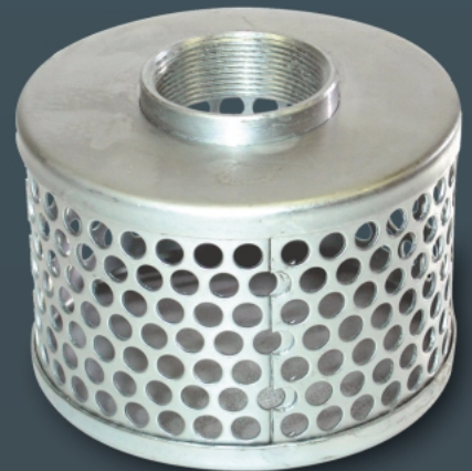
Standard Suction Strainer w/ Small Openings