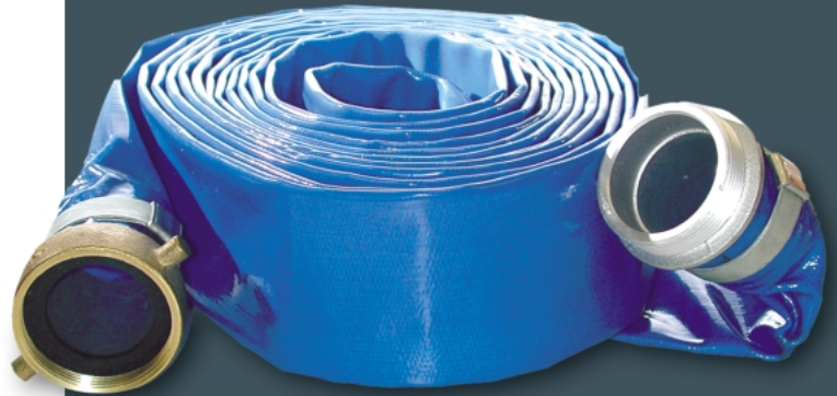
PVC Flexible Discharge Hose