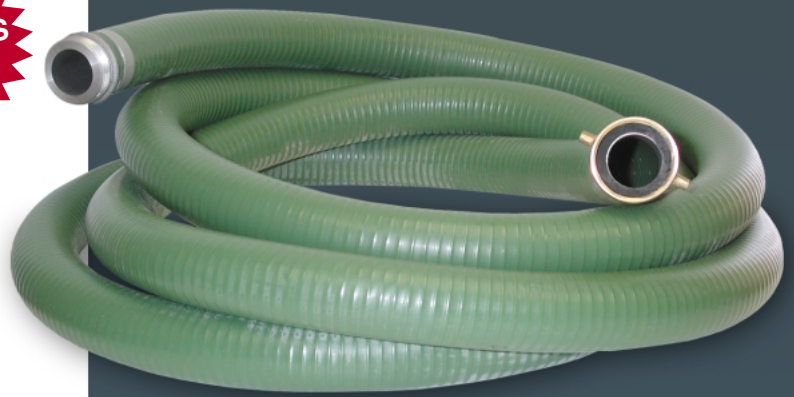
PVC Reinforced Suction Hose