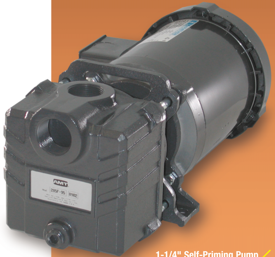
1-1/4" Self-Priming Pump

The AMT Self-Priming Cast Iron Centrifugal pumps are designed for circulating, boosting, washdown, liquid transfer and dewatering applications. Dual volute design reduces radial load on motor. The centerline discharge feature is specifically designed to prevent vapor binding and makes for convenient piping connections. All models are fitted with self-cleaning, semi-open impellers. The units will self-prime to 20 Ft. Mounting bases feature 7/16" mounting holes which are 6" OC (on center). Built in carrying handles offer portability.